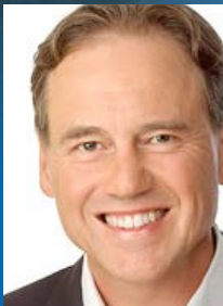
The Honourable Greg Hunt MP